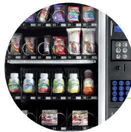
Maximum flexibility with a reduced footprint