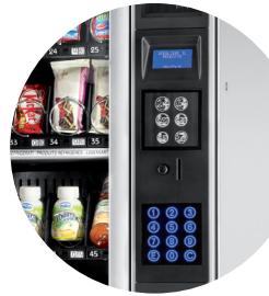
Refined design with high tech details