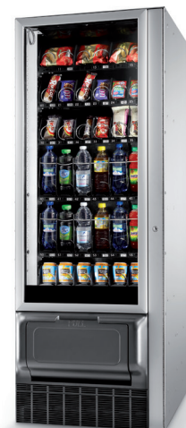
Available in the Slave Version with two different layouts

Necta reserves the right to alter specifications without previous notice.