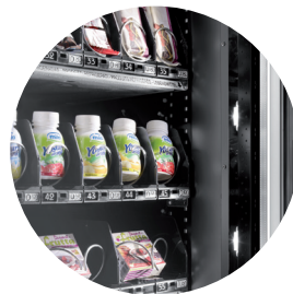
Stratified temperature inside the cell