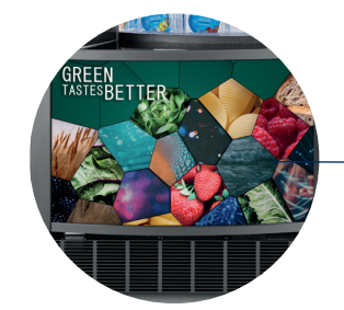
A simple design for a true automatic canteen