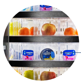
Variable temperature options