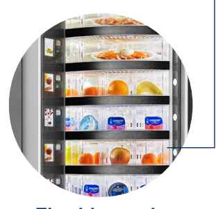
Flexible snack, food and drinks offer