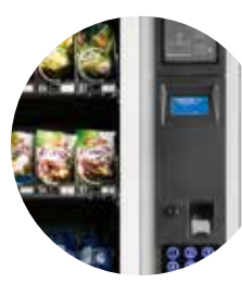
Uncluttered design and high end features