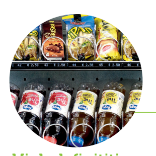
High definitition window