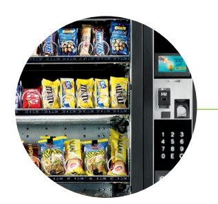
An elegant and refined model