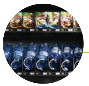
Stratified temperature inside the cell