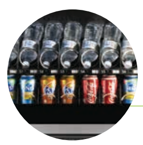
Highly flexible offer