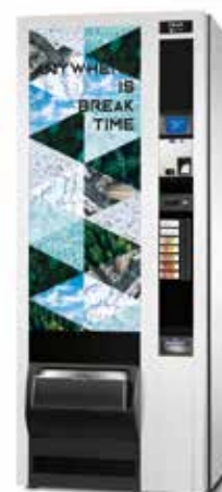
Diesis 500 model