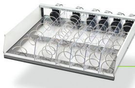
Visioshop, panoramic drawers for a perfect vision