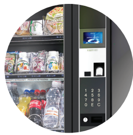
An elegant and refined model