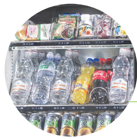
High definition window