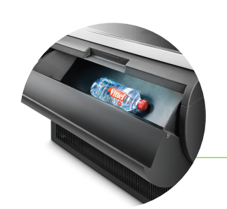
Easy and safe product dispensing.